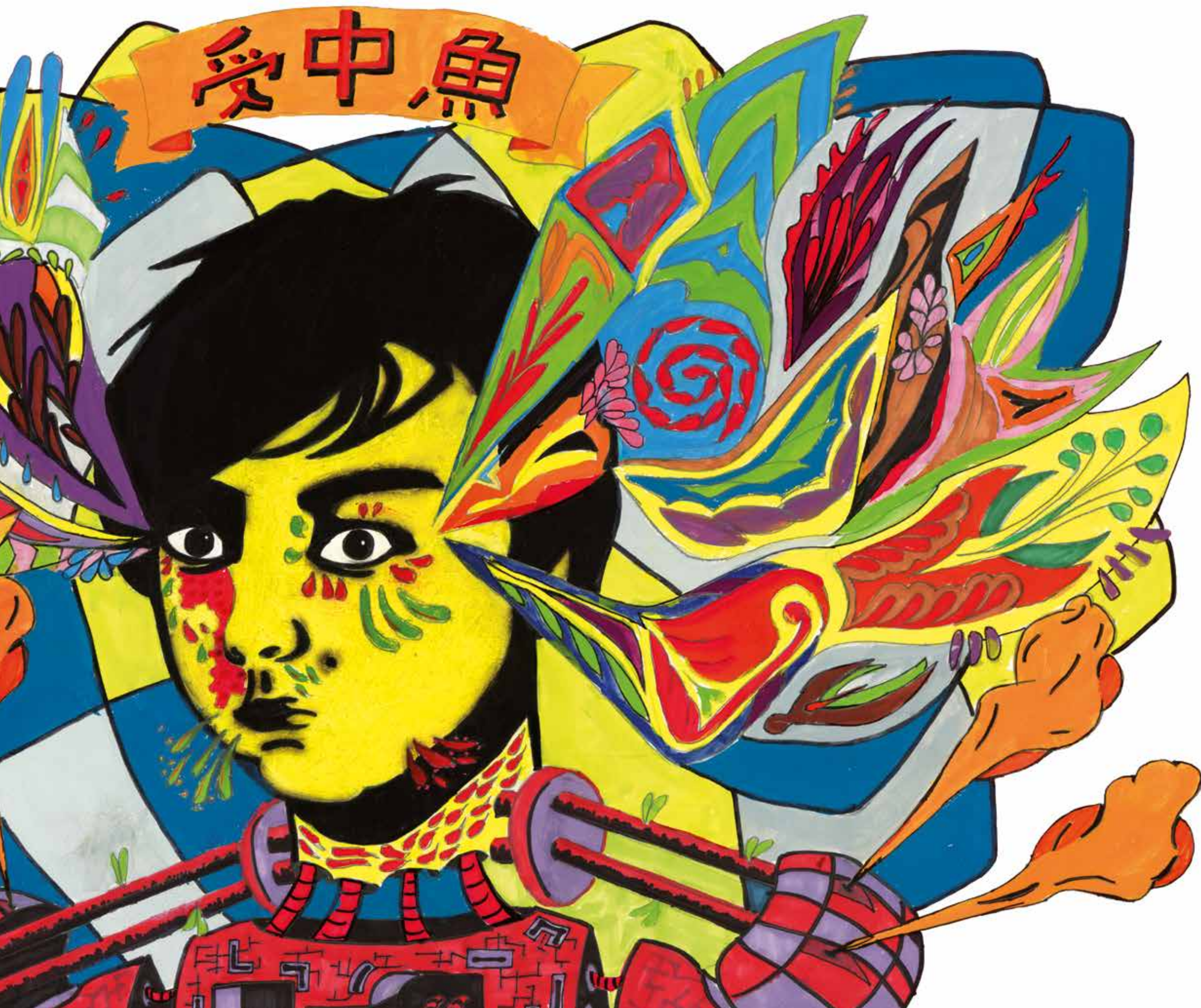
Self portrait Leonardo Year 11

When you leave school, you need to get on with all kinds of people, with all sorts of abilities, from all types of places. Come to Portland Place and you'll meet a great mix of people who will inspire you in all the adventures to come.