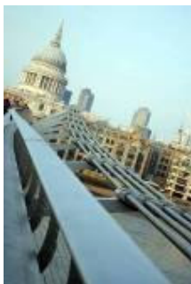
Millennium Bridge and St Paul's Cathedral by Insaf Sulaiman, A-Level Photography.