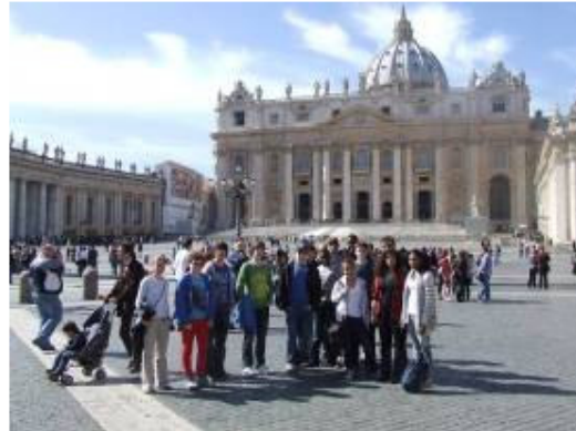
GCSE Classics Trip to Rome