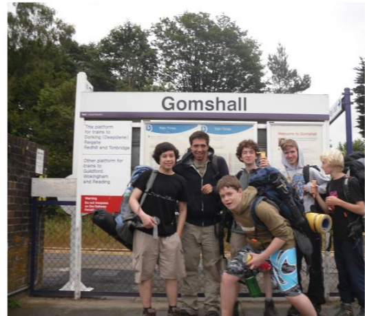
Duke of Edinburgh Trip during the Summer break