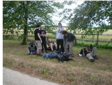
Duke of Edinburgh Bronze Awards Trip